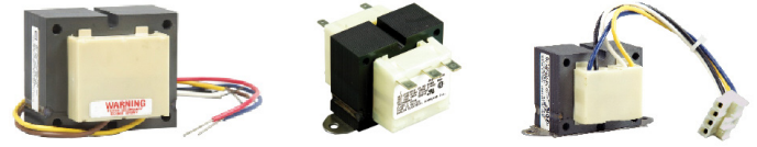
Class 2 Transformers

customer specification. Products are sold to OEMs (original equipment manufacturers) for incorporation into their end products.