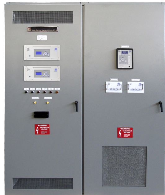
Dual DECS-450 Excitation System

Systems utilizing DECS-250, 250N, 250E, 450, or 2100 controls have expanded scope to fit a wider range of capabilities with field current up to 10,000 Adc. Complete excitation systems provide automatic voltage regulation, paralleling, and frequency compensation. These units are specified for replacement of rotary exciters or pilot exciters during power plant retrofitting or applied as original equipment in new facilities. They are applied to generators installed at electrical utilities, hydroelectric generating sites, and other large industrial generating facilities. These systems are also used in industrial motor applications.